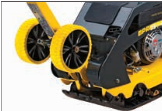
The transport wheels allow for one-person movement around the jobsite.