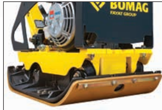
The Vulcolan mat helps avoid damage to paving stone surfaces.